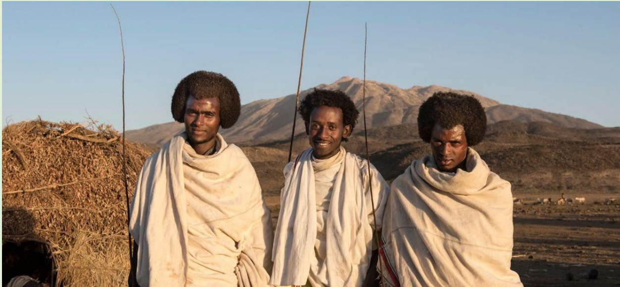
Young Karrayyu men holding harooressa in other festivities and good times

Harooressa is a sacred object normally taken to rituals and ceremonies. These young Karrayyu men from a different ceremony are holding it for festivities and good times. Their harooressa supplication produced joyous celebrations.