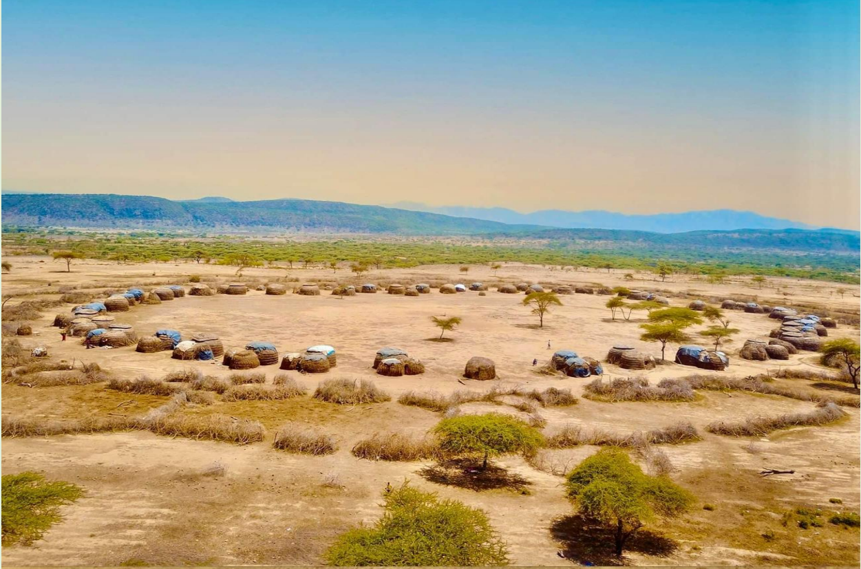
Karrayyu gadaa village, peacefully and harmoniously integrated into the natural environment

The Karrayyu are one of the few surviving pastoralist communities in East Africa who live in harmony with the natural environment. Their rhythms of life are tuned into the fundamental truth that all living and nonliving beings in the universe are inseparably woven together by the checks and balances of respectful egalitarian relationships.