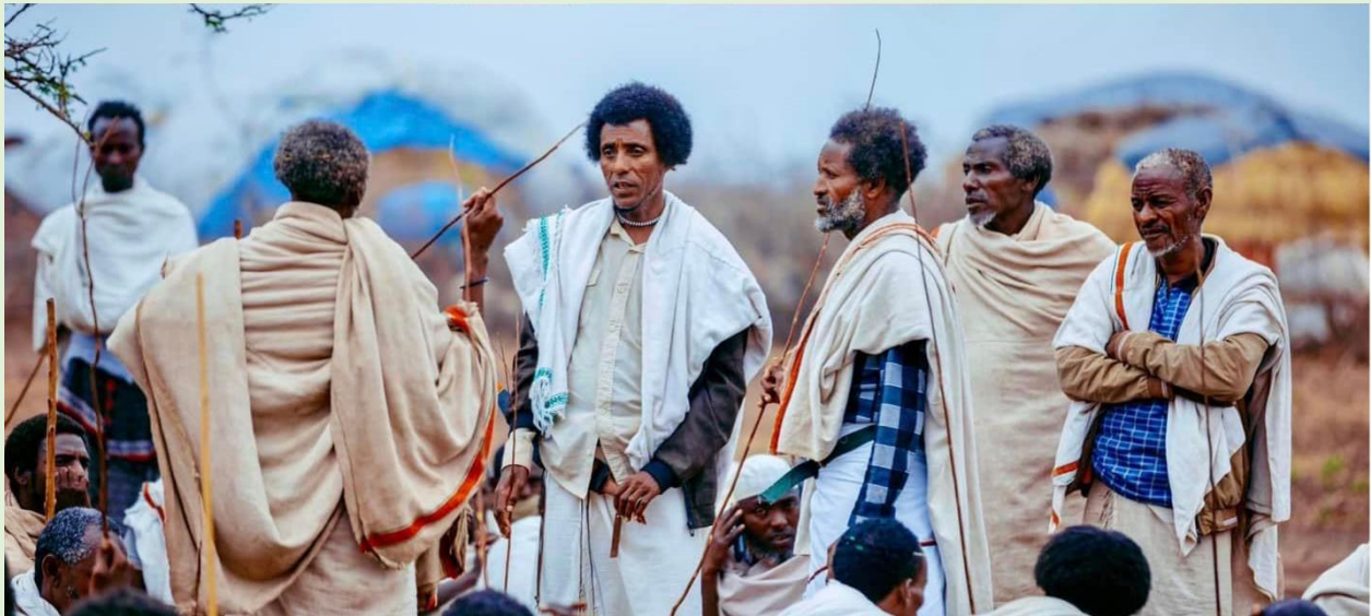
Some Elders of the Michillee gadaa massacred on December 1, 2021

Prayers and offerings notwithstanding, they continue to be pushed into the margins . Their continued existence is in peril, much like other Indigenous peoples of the world. The picture below shows Karrayyu gadaa leaders in a moment of vulnerability.