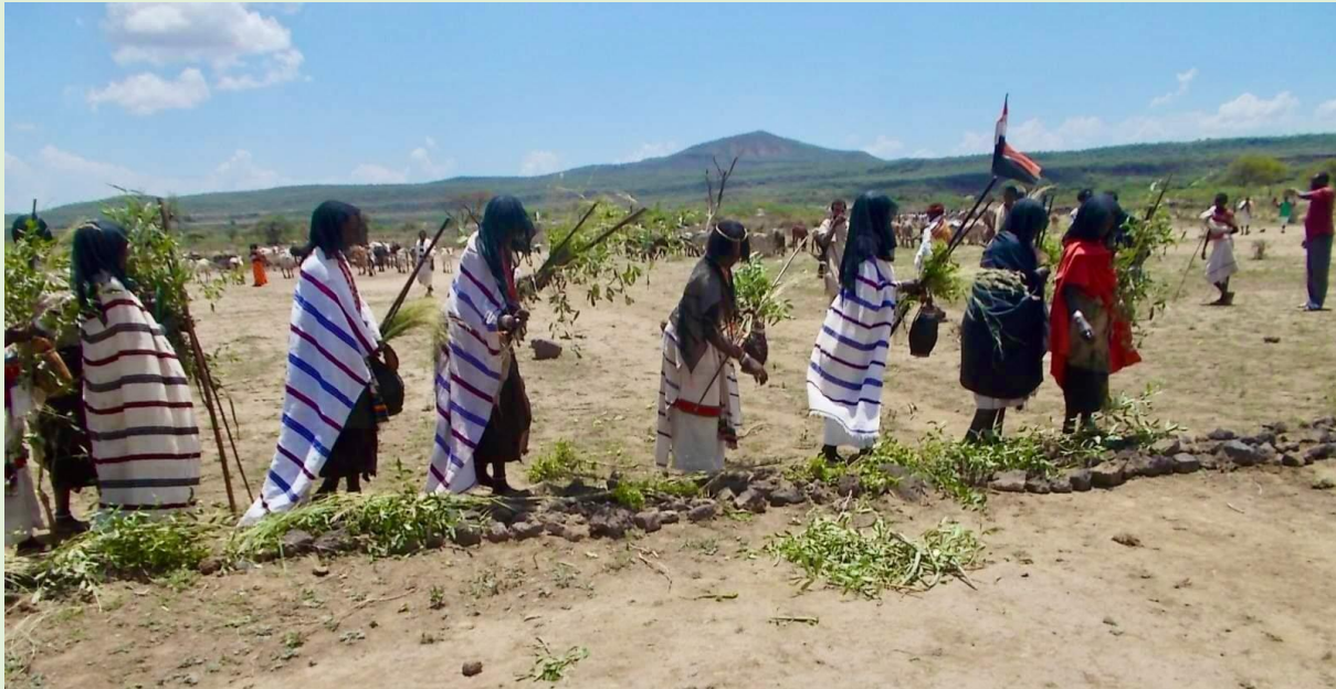
At the gadaa village, Karrayyu women hold their siingees and perform thanksgiving.

In every ritual, women's siingee is harmoniously keyed into gadaa to uphold the checks and balances of the fundamental truth. The pictures below show Karrayyu women performing their thanksgiving rituals of Irreessa (aka Irreecha ) at the gadaa village.