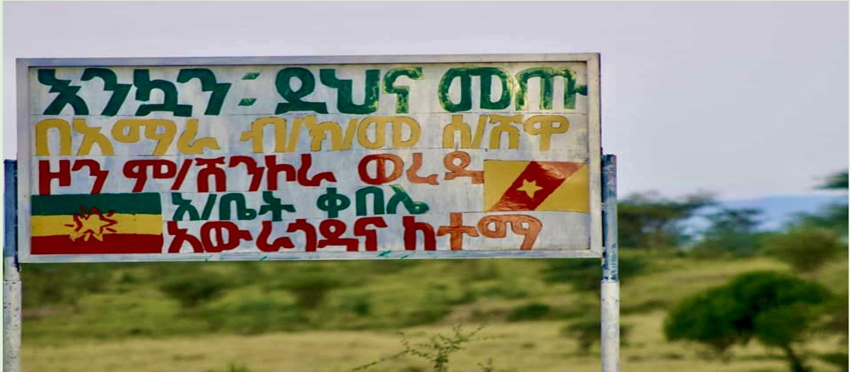
Welcome to Amhara Region, North Shewa Zone, M/Shenkora District

Located on the Addis Ababa to Djibouti road, this welcome sign heralds the new town of Amhara settlement in Oromia. A Karrayyu eyewitness says that the Karrayyu community took down this sign several times disputing the illegal settlement. However, the settlers kept putting it up again. Unfortunately for the Karrayyu, the new settlement is protected by the federal military and regional forces of Oromia.