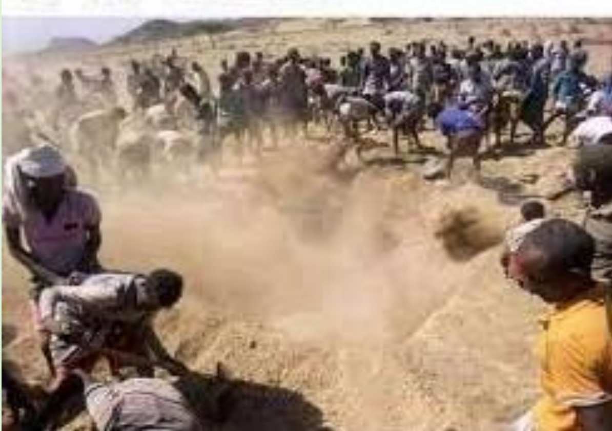
A traumatized Karrayyu community burying its slaughtered leaders in mass graves

Karrayyu leaders were preparing for festive Indigenous gadaa ceremonies when they unexpectedly faced their final moments on earth. A moment of truth in the most desolate of places. The shockwaves continue to reverberate throughout the world. And our hearts continue to tremble with the traumatized Karrayyu community.