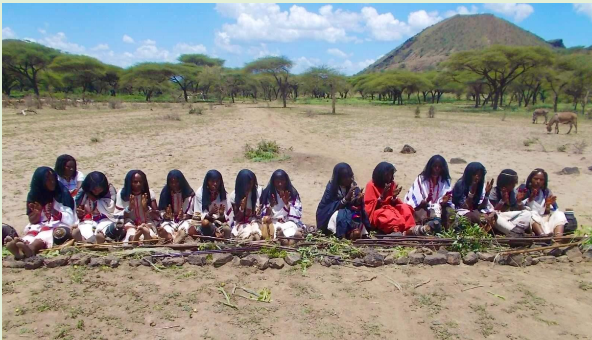
Karrayyu women lay down their siingee before them and sing Umayyoo.